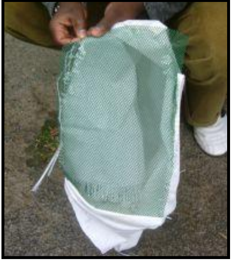
Basic Beekeeping Manual 1: How to make a simple Bee Veil (© Author Pam Gregory, who offers this as her gift to beekeepers in developing countries)