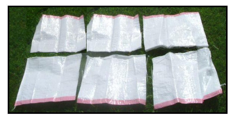
Basic Beekeeping Manual 1: How to make a simple Bee Veil (© Author Pam Gregory, who offers this as her gift to beekeepers in developing countries)

It is possible to make six bee veils from one flour sack if it is cut carefully.